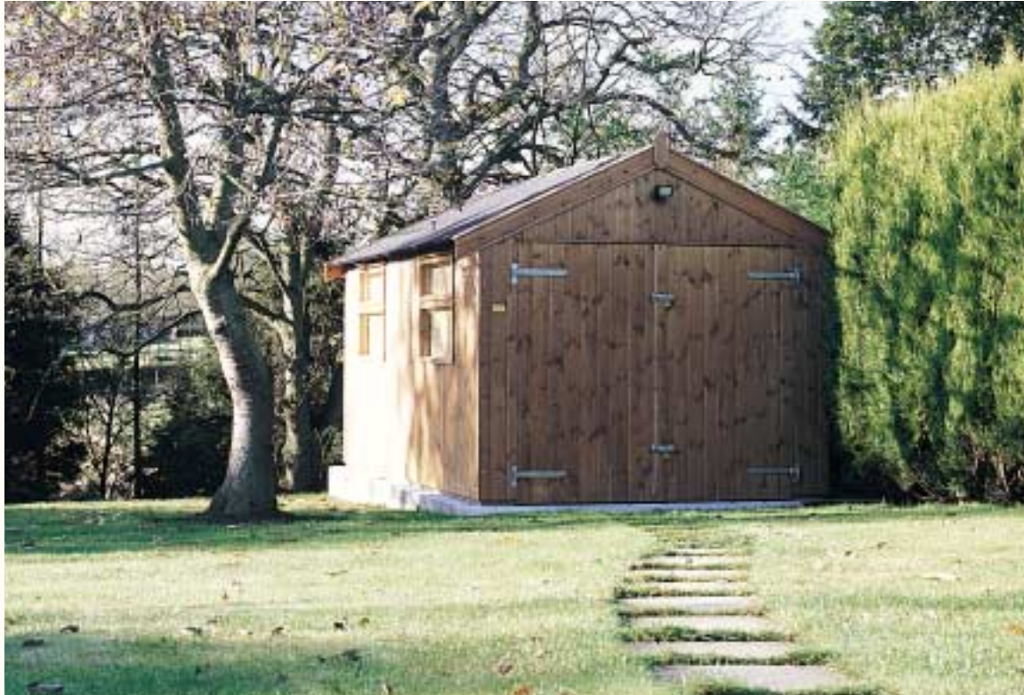
Opposite: Large potting shed in North Cheshire