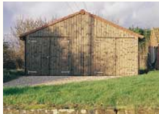
Right: 20' x 20' double garage with tiled roof built to a customer's own specification