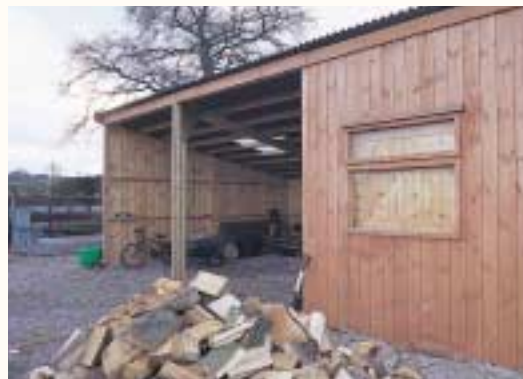
Right: The enclosed storage area of this implement store features Clydesdale's internal security shutters