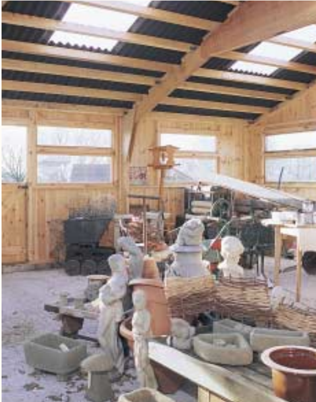
Above left: This interior view reveals the rugged construction typical of a Clydesdale building