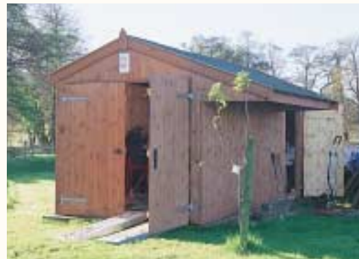
Right: A combination shed/workshop built to a custom design