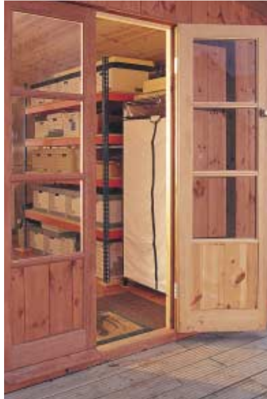
Above right: Individual requirements such as these glazed doors can easily be accommodated