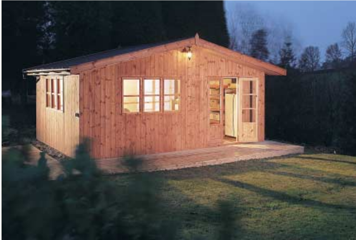
Opposite: A Clydesdale fishing hut adjacent to a Salmon river in Cumbria