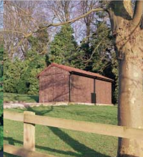
S E C T I O N A L T I M B E R B U I L D I N G S