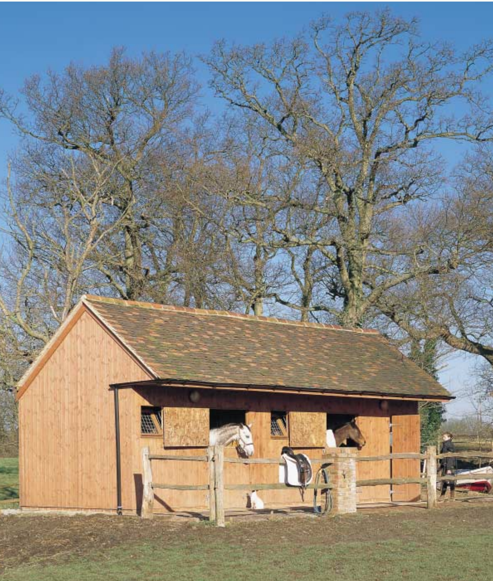
S T A B L E S