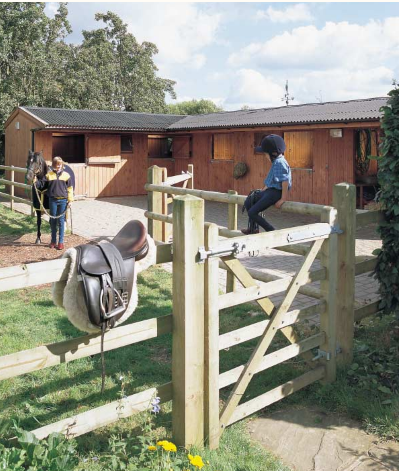
S T A B L E S